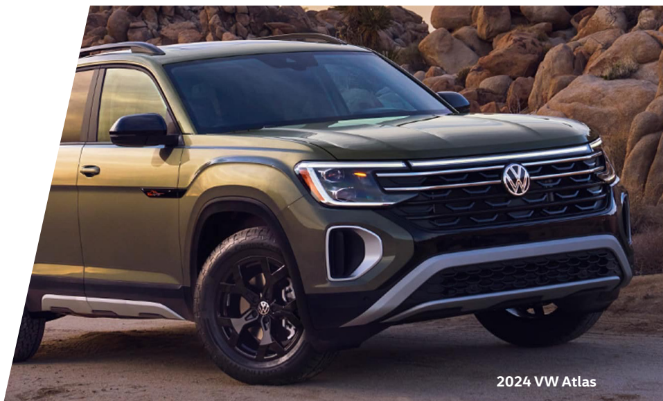
2024 VW Atlas

Our employee wages have far outpaced inflation over the past 10 years